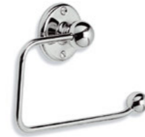
LB 4932 EDWARDIAN PAPER HOLDER