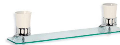
LB 4517 CLASSIC TWO MUG GLASS SHELF