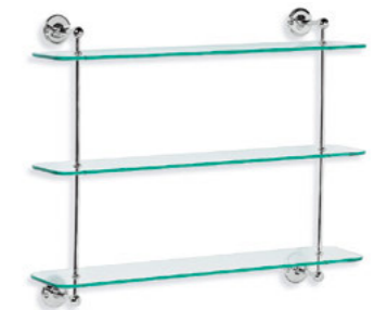
LB 4518 THREE TIER GLASS SHELF