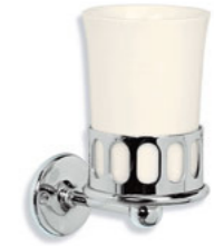
LB 4502 CLASSIC FINE BONE CHINA MUG & HOLDER