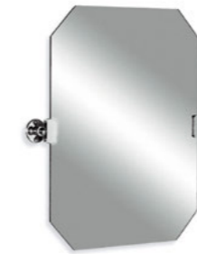
LB 4946 EDWARDIAN OCTAGONAL TILTING MIRROR