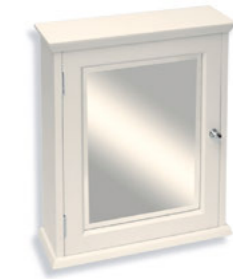
LB 3702 CLASSIC SMALL MEDICINE CABINET