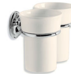
LB 4951 EDWARDIAN DOUBLE CHINA MUG & HOLDER