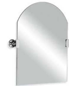
LB 4939 EDWARDIAN DOME TILTING MIRROR