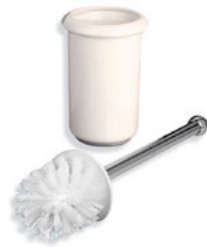
LB 4504 CLASSIC FREE STANDING CERAMIC POT & BRUSH