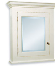
LB 3701 LARGE MEDICINE CABINET