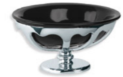
BK 4515 BLACK FREE STANDING SOAP DISH HOLDER WITH FINE BONE CHINA DISH