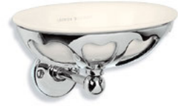
LB 4505 CLASSIC CAST BRASS SOAP HOLDER WITH FINE BONE CHINA DISH