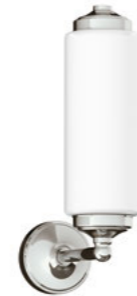
LB 4009 STANDARD TUBULAR WALL LAMP