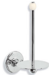
LB 4501 CLASSIC SPARE PAPER HOLDER WITH CERAMIC ACORN