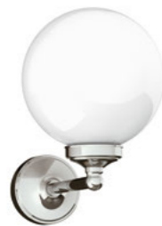
LB 4000 STANDARD 6" GLOBE WALL LAMP