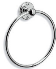
LB 4931 EDWARDIAN TOWEL RING