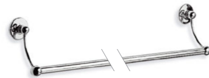
LB 4948 EDWARDIAN TOWEL RAIL (LONG 30")