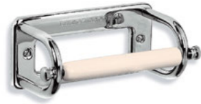
LB 4500 CLASSIC PAPER HOLDER WITH CERAMIC BAR