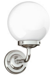
LB 4010 CLASSIC 8" GLOBE WALL LAMP