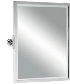
LB 4509 CLASSIC TILTING MIRROR WITH BRASS FRAME & BEVELLED GLASS