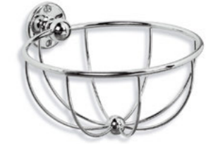
LB 4506 CLASSIC CIRCULAR REAL SPONGE BASKET