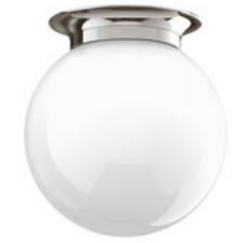
LB 4003 CLASSIC CEILING LIGHT WITH 8" GLOBE