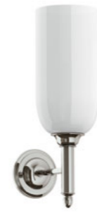
LB 4019 CLASSIC FLUTE WALL LAMP