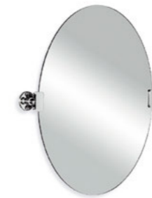
LB 4961 EDWARDIAN OVAL TILTING MIRROR