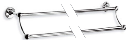
LB 4949 EDWARDIAN DOUBLE TOWEL RAIL (LONG 30")