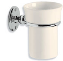
LB 4933 EDWARDIAN CHINA MUG & HOLDER