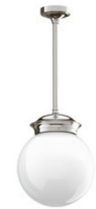
LB 4006 CLASSIC DROP CEILING LIGHT WITH TUBULAR STEM & 8" GLOBE