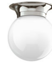
LB 4002 CLASSIC CEILING LIGHT WITH 6" GLOBE