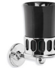
BK 4502 BLACK FINE BONE CHINA MUG & HOLDER