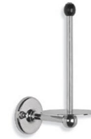
BK 4501 BLACK SPARE PAPER HOLDER WITH CERAMIC ACORN