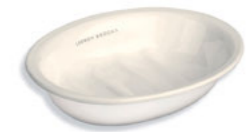
LB 4516 CLASSIC FREE STANDING FINE BONE CHINA DISH