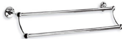
LB 4954 EDWARDIAN DOUBLE TOWEL RAIL (STANDARD 20")