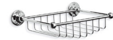
LB 4950 EDWARDIAN WIRE SPONGE DISH