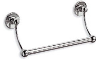
LB 4947 EDWARDIAN TOWEL RAIL (SHORT 10")