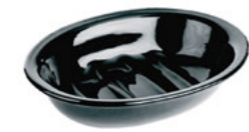
BK 4516 BLACK FREE STANDING FINE BONE CHINA DISH