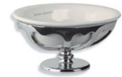
LB 4515 CLASSIC FREE STANDING SOAP DISH HOLDER WITH FINE BONE CHINA DISH