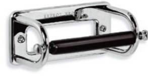
BK 4500 BLACK PAPER HOLDER WITH CERAMIC BAR