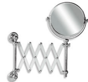
LB 4955 EDWARDIAN EXTENDABLE SHAVING MIRROR