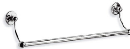
LB 4935 EDWARDIAN TOWEL RAIL (STANDARD 20")