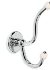
LB 4511 CLASSIC DOUBLE ROBE HOOK