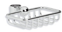
LB 1702 EDWARDIAN RISER SOAP DISH