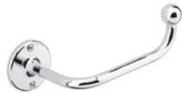
LB 4525 CLASSIC RIGHT ANGLE BAR & BALL PAPER HOLDER