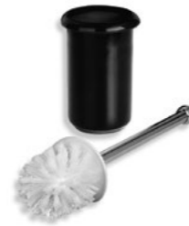
BK 4504 CLASSIC BLACK FREE STANDING CERAMIC POT & BRUSH