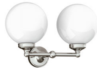
LB 4001 DOUBLE 6" GLOBE WALL LAMP