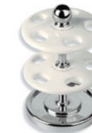
LB 4956 EDWARDIAN FREE STANDING CERAMIC TOOTHBRUSH HOLDER