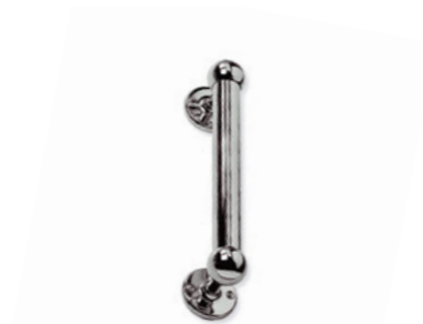
LB 4952 EDWARDIAN GRAB BAR