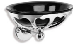
BK 4505 BLACK CAST BRASS SOAP HOLDER WITH FINE BONE CHINA DISH