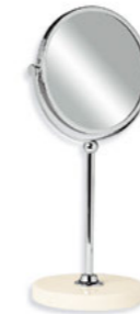
LB 4958 EDWARDIAN FREE STANDING VANITY MIRROR