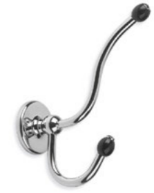
BK 4511 CLASSIC BLACK DOUBLE ROBE HOOK