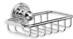
LB 4934 EDWARDIAN WIRE SOAP DISH