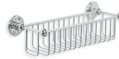
LB 4510 CLASSIC SHOWER BOTTLE RACK