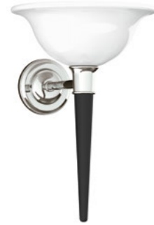
LB 4018 CLASSIC TORCH WALL LAMP