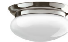
LB 4004 CLASSIC CEILING LIGHT WITH 10" OVAL GLOBE