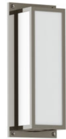
DP 4015 DECO WALL LAMP