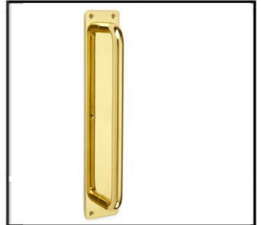
Pull Handle On Plate 1691

Dimensions: Other sizes available are below: