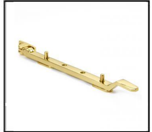
Art Deco Casement Stay 7017

Dimensions: Other sizes available are below: