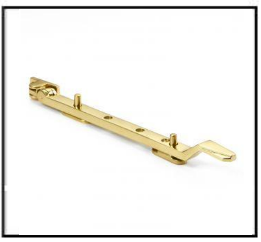
Art Deco Casement Stay-Locking7017L